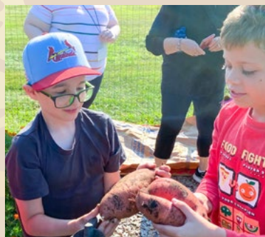
Learning & Doing