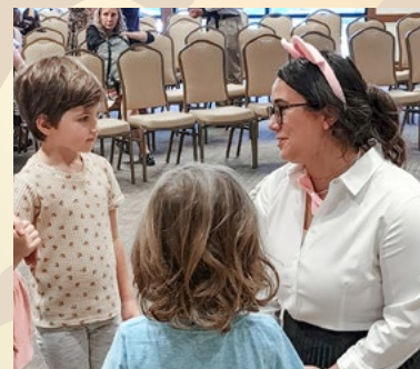
Care & Meaning