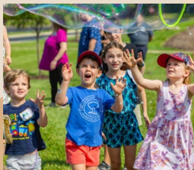
Awe & Joy