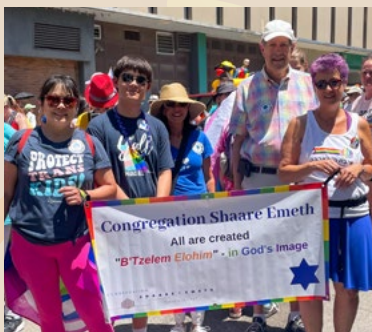
Justice & Outreach