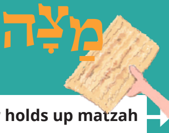
Leader holds up matzah

You may choose to dip a finger into your wine cup with each plague and let a drop fall on your plate. One reason for this tradition is to show that our joy is diminished by the suffering of others—even if they deserve punishment.