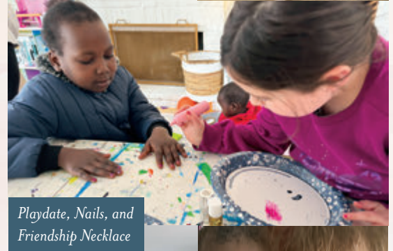
Playdate, Nails, and Friendship Necklace