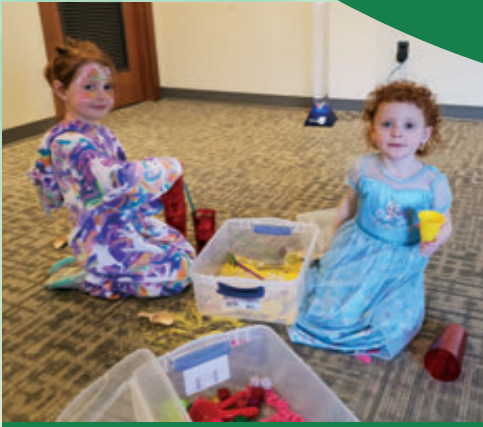
Family Spiel and Carnival