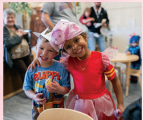
Shirlee Green Preschool Purim Parade