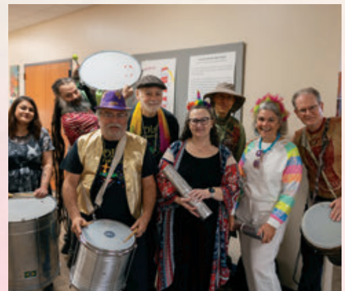
Joia Percussion Band